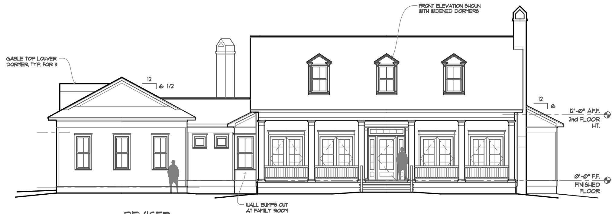
REVISED FRONT ELEVATION (WEST)